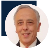
António Silva Ribeiro

Chief of General Staff of the Portuguese Armed Forces