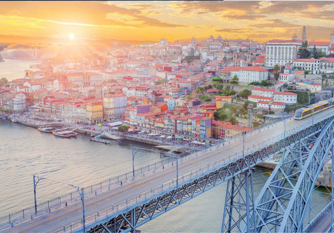
Porto, Portugal - Downtown "Ribeira" Sunset