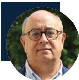
José A. Azeredo Lopes