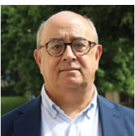
José A. Azeredo Lopes Coordinator of the International Studies Programme

Looking forward to seeing you in Porto, Portugal!