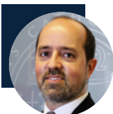
Manuel Fontaine Campos

PhD, International Law, Faculty of Law, UCP. Professor of Public International Law, International Legal Regimes and Arts, International Law, and International Relations, Porto Law School, UCP. Portugal's Minister of National Defence, 2015-2018. President, Portuguese Media Regulatory Authority, 2006-2011. Main interests and publications: self-determination of peoples, use of force, and international state responsibility.