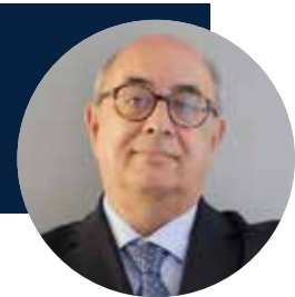
José A. Azeredo Lopes Universidade Católica Portuguesa

PhD, International Law, Faculty of Law, UCP. Professor of Public International Law, International Legal Regimes and Arts, International Law, and International Relations, Porto Law School, UCP. Portugal’s Minister of National Defence, 2015-2018. President, Portuguese Media Regulatory Authority, 2006-2011. Main interests and publications: self-determination of peoples, use of force, and international state responsibility.